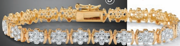
1/4 carat T.W.

D. DIAMOND FLOWER TENNIS BRACELET. 1/4 carat T.W. 7 1/4" length. Tutone. 18k gold over sterling silver. 0555-70587-471 was 220.00; NOW 99.99