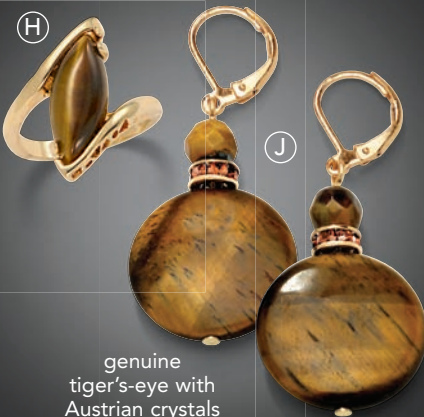
genuine tiger's-eye with Austrian crystals

G. NEW OVAL-SHAPED MOTHER-OF-PEARL CABOCHON RING. 18k gold over sterling silver. Sizes 6-10. 0555-35766-471 was 114.00; NOW 59.99