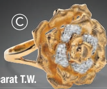
1/2 carat T.W.

C. NEW DIAMOND MULTI-PETAL FLOWER RING. 1/2 carat T.W. 18k gold over sterling silver. Sizes 6-10. 0555-56750-471 was 286.00; NOW 129.99