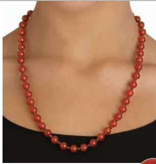
Jade with genuine garnets