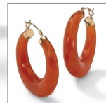
Available in red or green jade