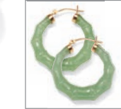
Available in red or green jade